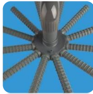
▪ Fitted with 1" polypropylene collector arms reinforced with fiberglass