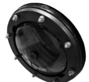
▪ Ø200mm polyester lateral manhole