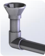
▪ Cone diffuser