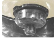
▪ Ø210 black polyester top lid from Ø500 up to Ø950 models and Ø400 black polyester top lid Ø1050 and Ø1200 models